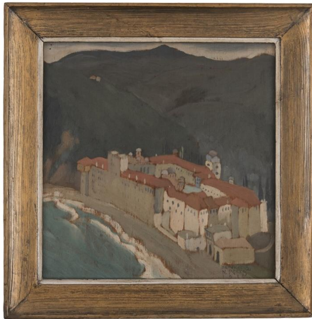
Polykleitos Rengos, Holy Monastery of Esphigmenou, 1934, oil on industrial wood, Tellogleion Fine Arts Foundation Collection, Aristotle University of Thessalonike