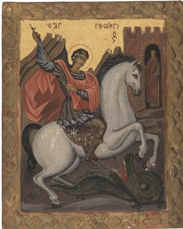
Polykleitos Rengos, Saint George, 1948(?), egg tempera on wood, Konstantinos Pol. Rengos Collection